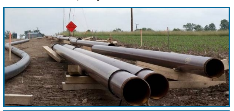
Coudersport photographer Curt Weinhold provided this picture of a Tioga County setting where workers were preparing to install pipes to usher shale gas to market.

Pipeline infrastructure development is governed by a complicated matrix of federal and state laws and regulations, county plans, and local ordinances. Multiple agencies are involved in permitting and overseeing siting, construction, operation, and maintenance of infrastructure. Over the coming months, some of the recommendations will be evaluated for possible implementation by state regulators. Industries, communities, landowners and others affected